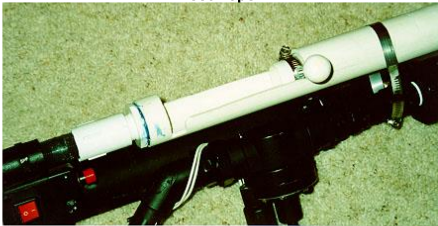
Breech open with "flare" held next to it: