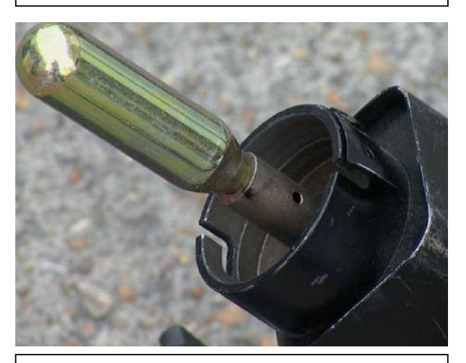
Screw a new Co2 bulb into the end of the solenoid unit until it stops.