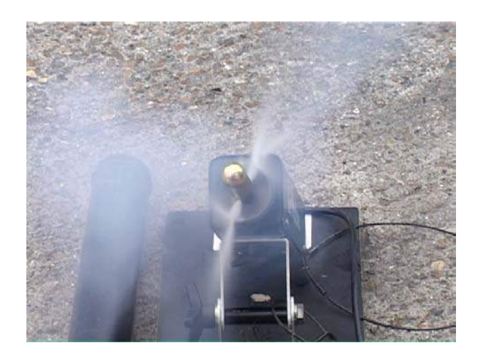
This is what happens when the cannon is fired and there is no barrel attached.

The one on the right has been used, you can tell because there is a hole where the firing pin has punctured the end. This bulb is now useless.