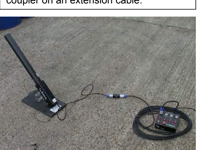
When Wired the setup should look like this.