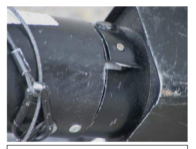
Twist the barrel counter clockwise until the barrel locks into place. A clip on the solenoid unit prevents the barrel being accidentally twisted. Connect the safety chain to the aluminium bracket.