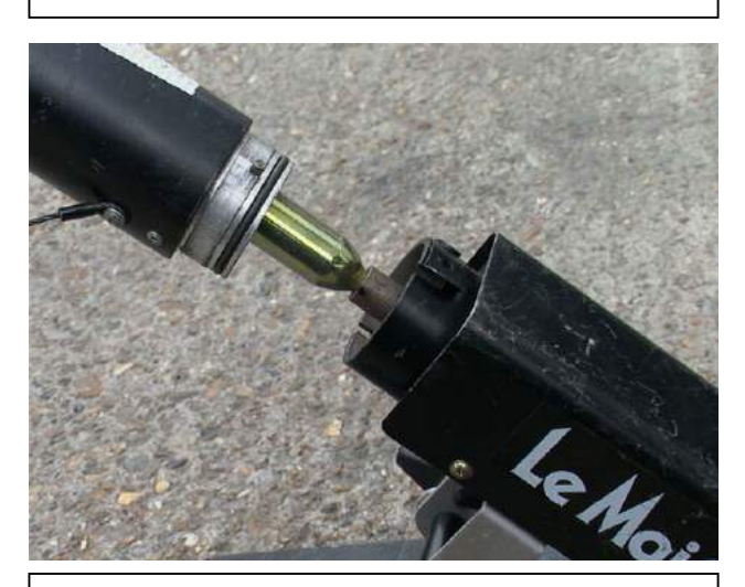
Place the loaded barrel over the Co2 Bulb.

Note the barrel has 2 pins, these pins mate with 2 slots on the solenoid unit.