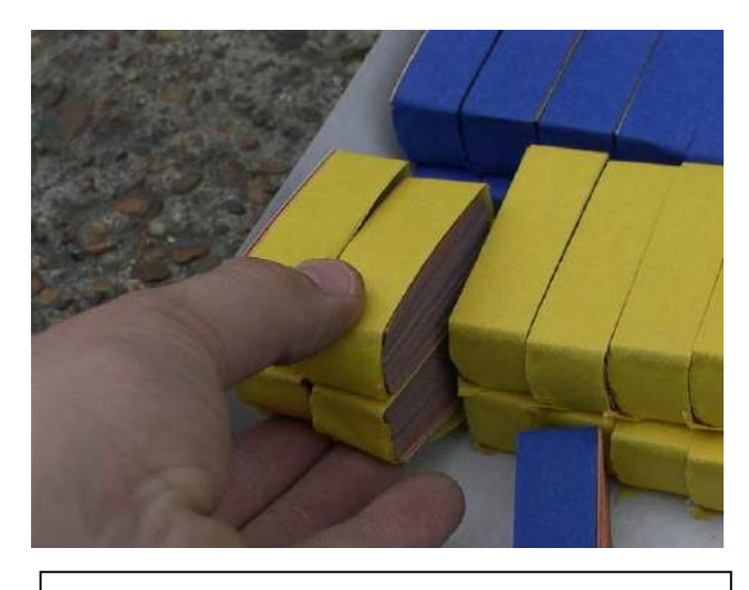
Carefully remove 4 wads of the confetti.