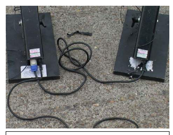
Here we have an example of where 2 cannons have been daisy chained. Both cannons can be fired from one supply cable, you can go further and add up to 8 more cannons on this line.