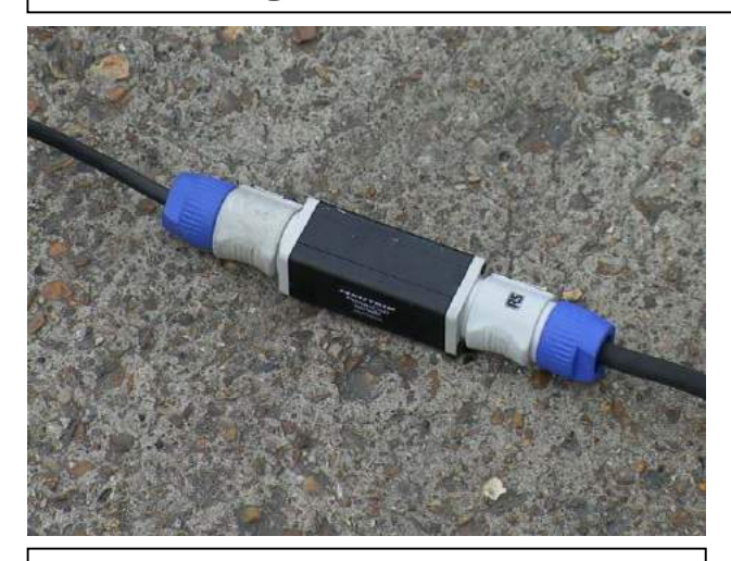
Connect the cannons connector into the coupler on an extension cable.