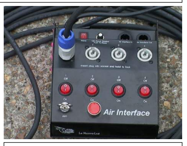
Connect the other end of the extension into one of the controller's outputs.

Note the barrel has 2 pins, these pins mate with 2 slots on the solenoid unit.