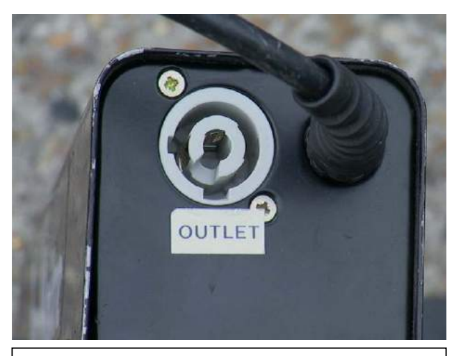
On the back of the cannon there is a powercon socket. This allows another cannon to be linked in. Up to 10 cannons can be daisy chained on each channel (only 10 cannons can only be fired at any one time).