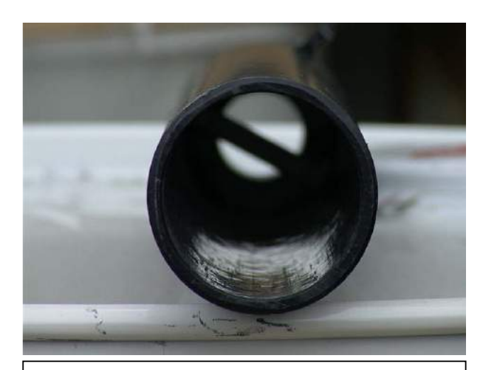
Check that the barrel is empty. You can see the metal stopper at the end.

The lifting Cap must be used for all types of filling