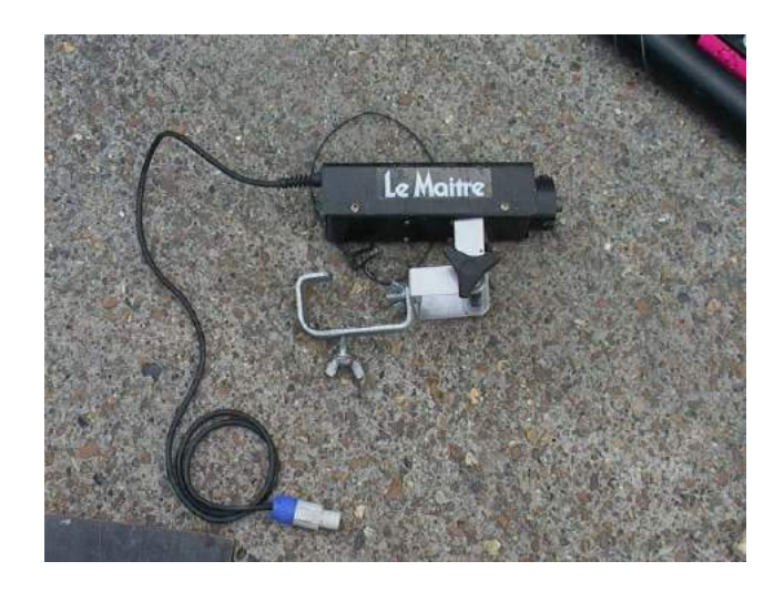
The solenoid unit mounted on a "G" Clamp