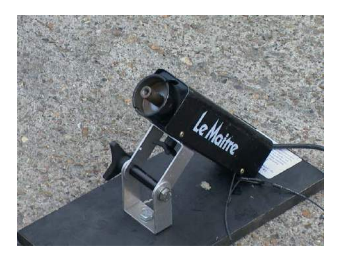
The Solenoid unit mounted on a board