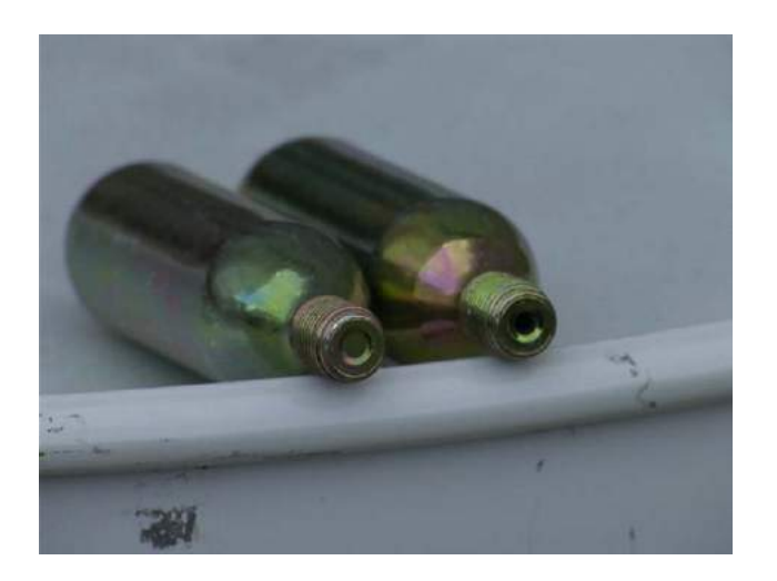
Here we have two 16g Co2 bulbs.