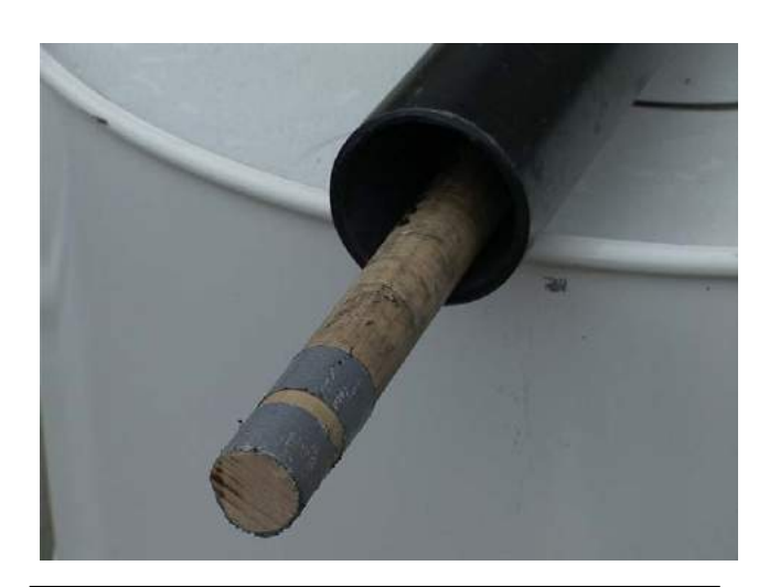
When the stick will not go any further, remove it and load the tube.