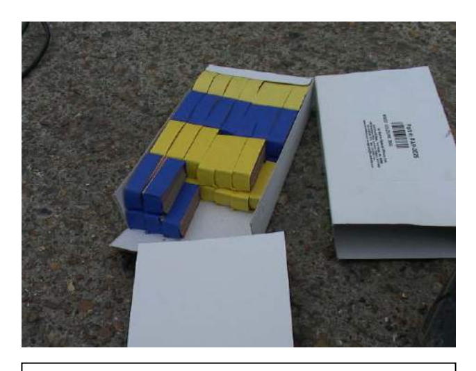
Open the box of Chinese Confetti and lower the opened end of the box. Remove the piece of card that separates the two layers.