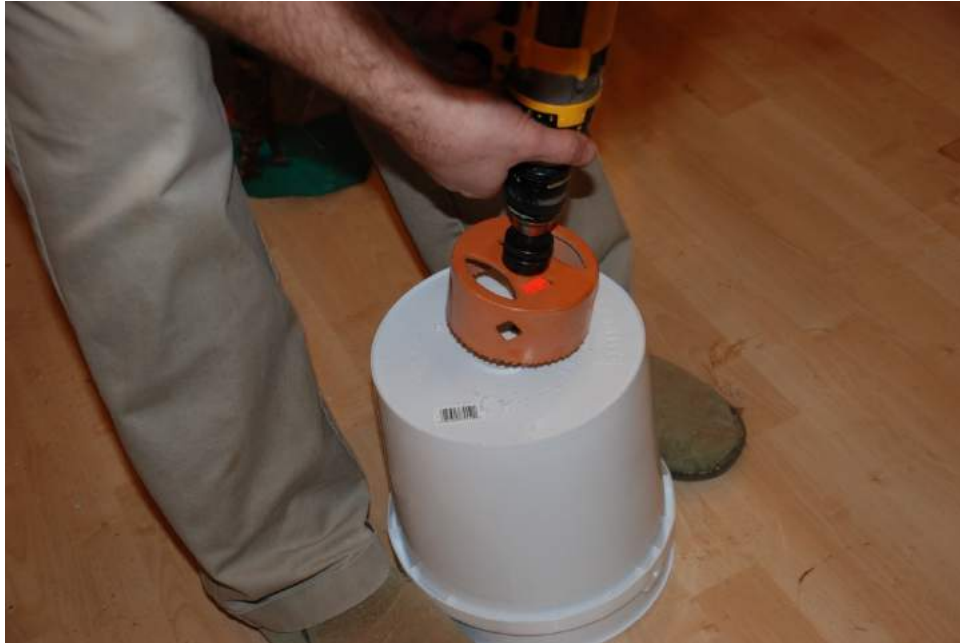
Figure 2 - Cut a hole about 6" diameter in the bottom of the bucket.... There's a hole in the bucket, dear liza.... If you don't have a 6" hole saw, just draw a circle with a compass or other round object and cut with a utility knife.