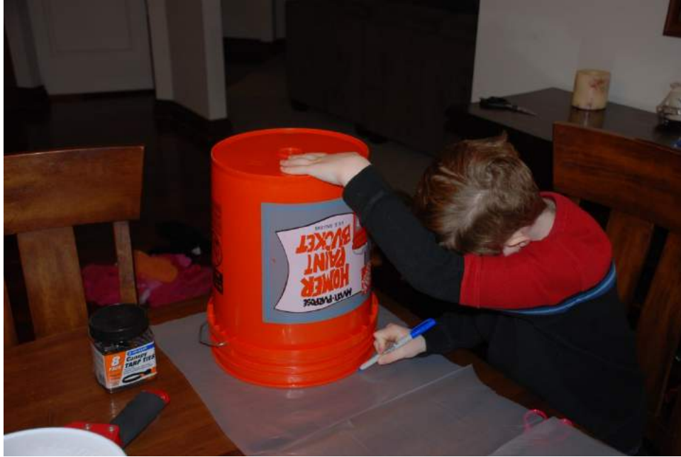
Figure 4 - Trace a circle in the 4 mil plastic sheeting. The "Homer Paint Bucket" was the perfect size. Yet another use for this amazing item.