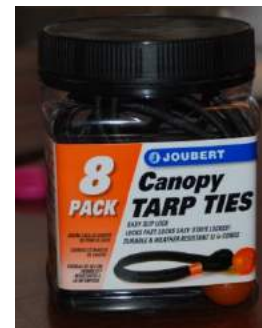
Figure 1 - Required materials. 2 Gallon bucket (left), 4 mil plastic sheeting (center), and canopy tarp ties (right).