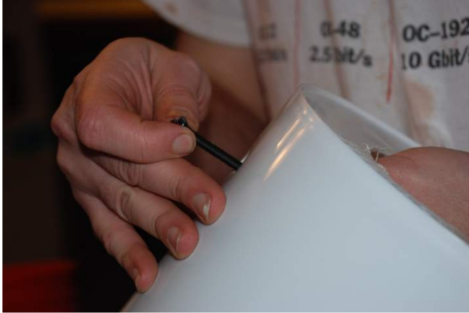
Figure 14 - Push one end of the bungee cord through the 1/4" hole in the side of the bucket. Repeat for the other piece of bungee on the other side of the bucket.