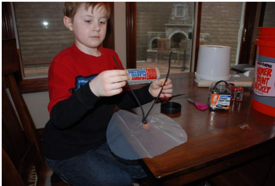
Figure 10 - Cut the bungee in half.