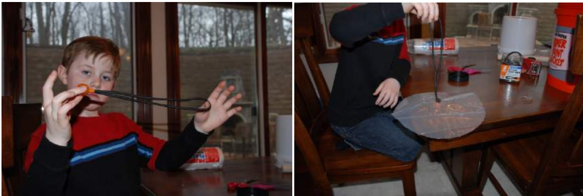
Figure 9 - Take one of the bungee tie downs and feed it through the hole in the plastic sheeting. Tie a knot in the bungee opposite the ball to hold the sheet in place on the bungee.