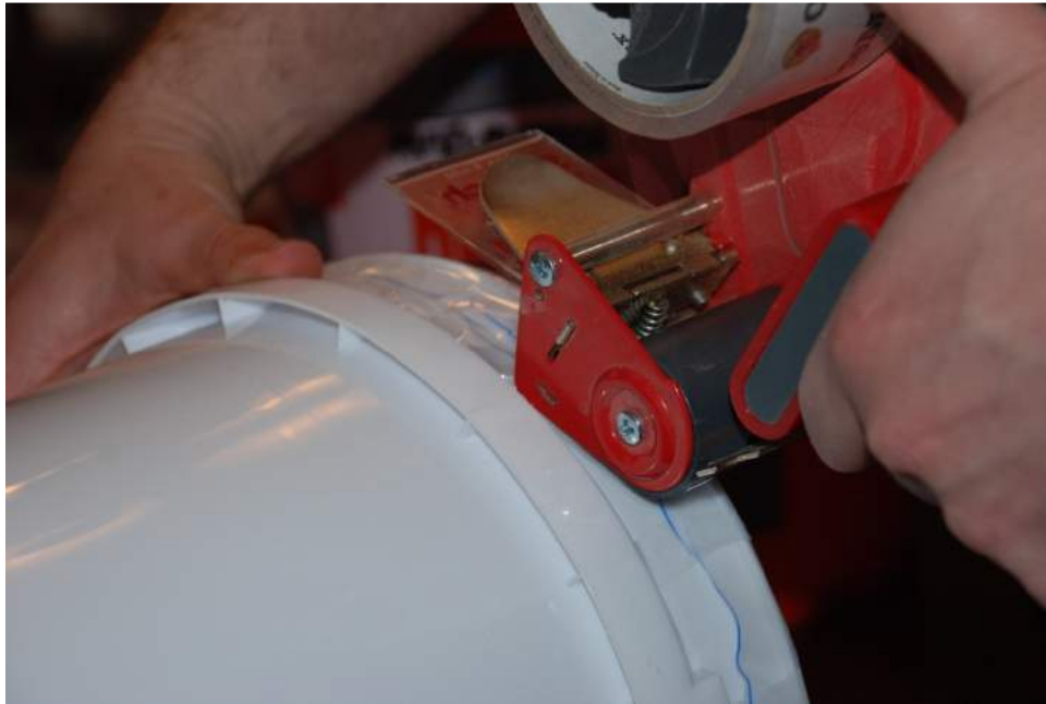
Figure 13 - Seal the plastic circle to the bucket with packing tape. We ran the tape about 2/3 over the bucket, and 1/3 hanging over the edge. After applying the tape, the 1/3 that was left hanging over the edge was pressed over into the plastic sheet. This helps seal the plastic sheet and better secures it to the bucket.