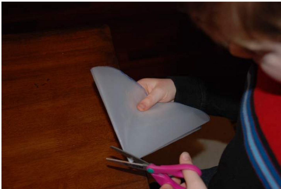
Figure 7 - Cut a small hole in the center. If you used the approach of folding it in half twice, you would just snip the very tip off.