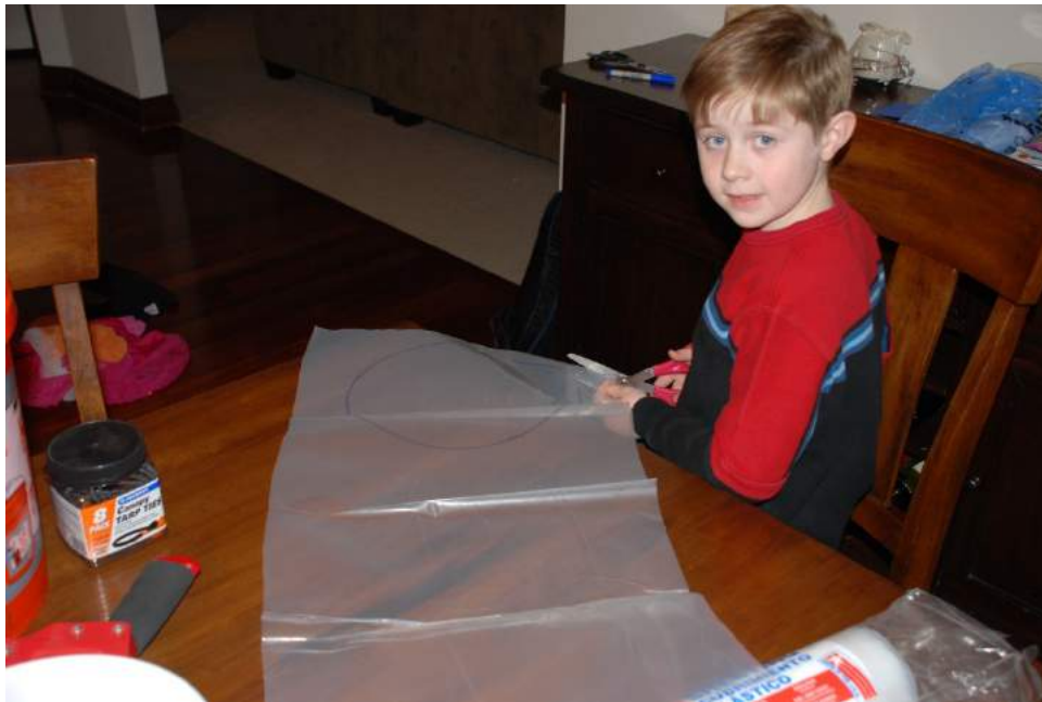
Figure 5 - Cut out the circle that you just traced. It took some experimenting to find the best scissors to cut this material cleanly.