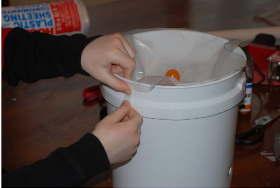
Figure 12 - Using Scotch tape, we very roughly attached the plastic circle to the bucket. The bungee cord side goes in and the orange plastic ball side goes out. The plastic needs to be attached so that the outer circle of the plastic is approximately at the edge of the bucket. Since the diameter of the plastic circle is larger than the bucket, this results in some bunching up of the plastic. The goal of the tape here is not to necessarily attach the plastic well, but just enough until the next step.