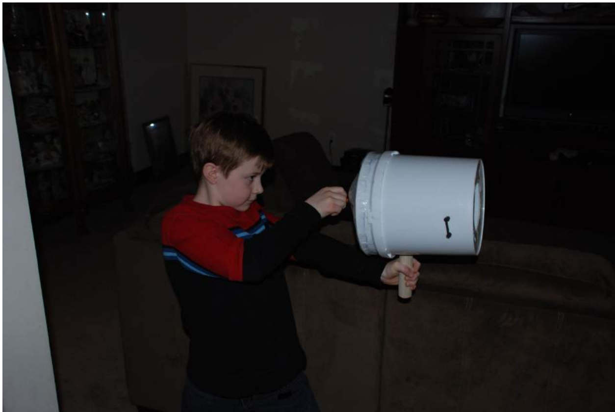
Figure 17 - Take aim, pull back on the orange ball/bungee, then release. The air vortex cannon should launch a 6", relatively focused blast of air.

While this does not look as slick as the one you can buy, it is a very functional air cannon that is fun to build. We were blowing out candles at over 20 feet. We could have gone farther, but we were limited by how well we could aim it, not by how focused the air blast was. The aiming of our initial build did seem a little off.