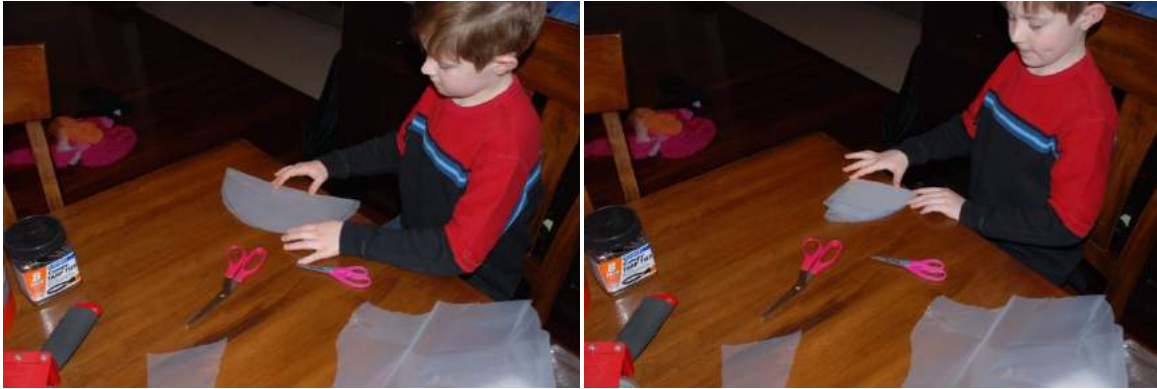
Figure 6 - Find the center of the circle. We found the best way was to fold it in half twice.