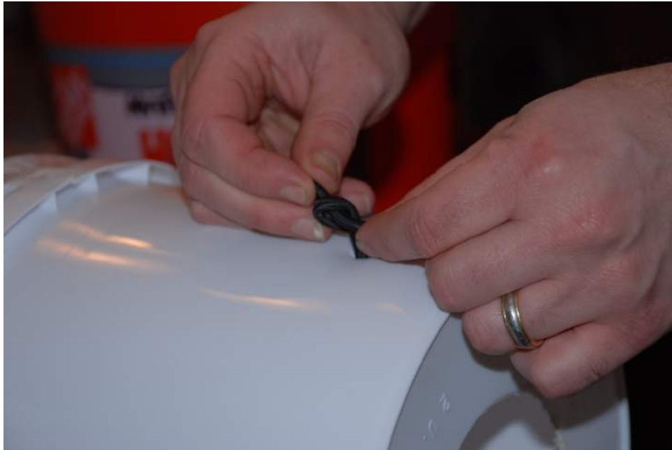
Figure 15 - Tie a knot in the bungee cords on the outside of the bucket. For the size bucket and bungee we used, there was about 1" of extra material after the knot. You may need to adjust the location of the knot to provide correct tension on the bungee. The cord should be slack with the plastic sheet pressed all the way in the bucket, but in tension when the sheet is pulled back.