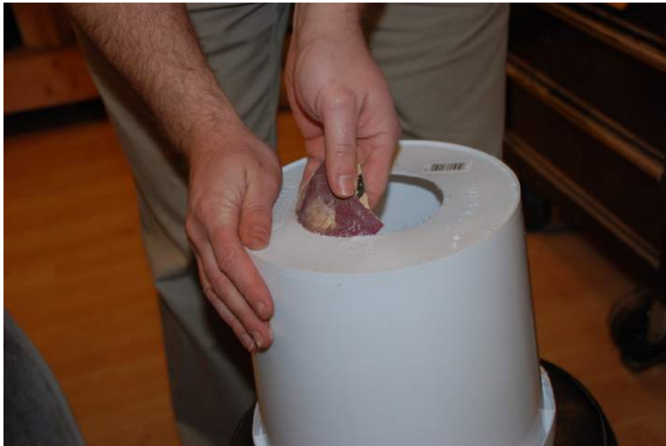
Figure 3 - We removed any sharp edges with 120 grit sandpaper.