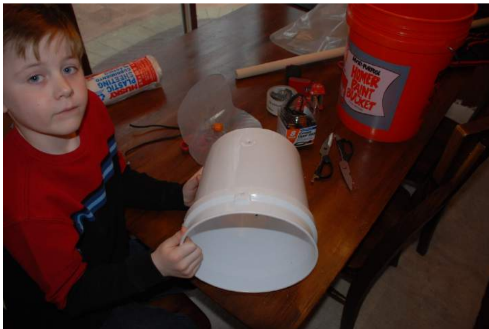
Figure 11 - Cut two small holes in the side of the bucket near the bottom. We used a 1/4" drill bit and drilled them 2" from the bottom. The holes need to be on opposite sides of the bucket for the bungee cord to go through. If you don't have a 1/4" drill bit, scissors or a utility knife will do. Just don't cut the holes too large.